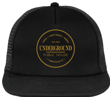
Mesh Back Trucker Hat $20