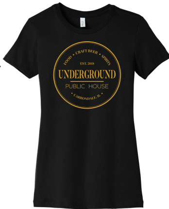
Womens T-Shirts $20