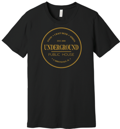
Mens/Unisex T-Shirts $20