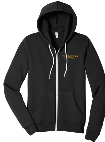
Hoodie Sweatshirts $40