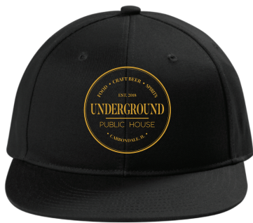
Full Fabric Back Ball Cap $25